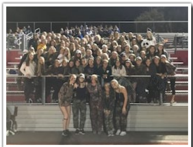
Thanks to our students who have been cheering on our fall athletes!